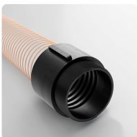
Combiflex PU threaded connector, fixed cast-on fixed PU threaded connector for all Master-PUR L, Master-PUR H and Master-PUR HX hose types, based on DIN ISO 228