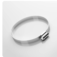
Hose Clamp with Worm-Gear Standard clamp for fastening light hose types to connecting pieces on mobile and stationary installations