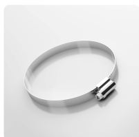
Hose Clamp with Worm-Gear Standard clamp for fastening light hose types to connecting pieces on mobile and stationary installations